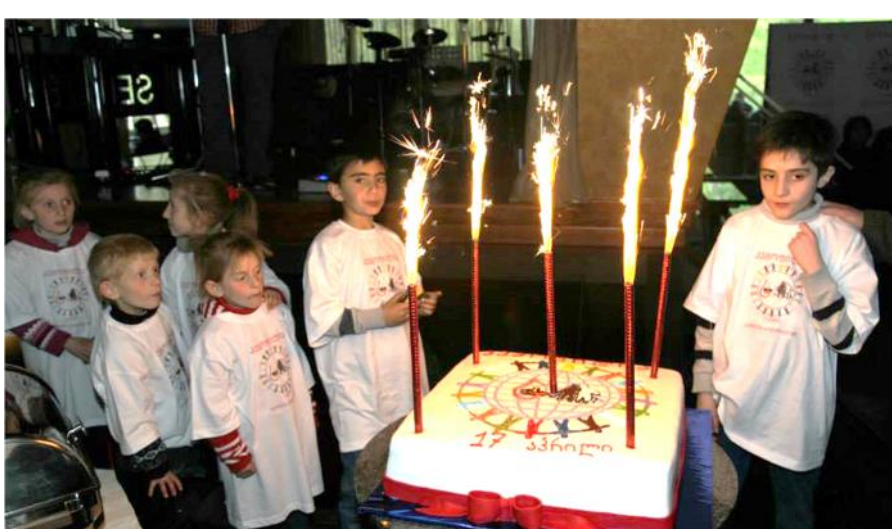
Young members of the GAHD celebrating World Haemophilia Day in 2012

be very difficult to finance these projects in the future.