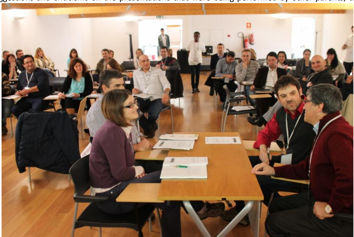
Interactive sessions during the conference

All parents actively participated. They were divided into three groups, interacted and submitted suggestions and criticisms on the presentations that were being performed by other parents, thus