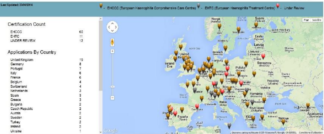
Screenshot of the EUHANET European Haemophilia Centre Certification Page

As the name indicates it, EHCCC offer more comprehensive services not only for medical specialties but also paramedical and laboratory services and in general have a greater number of patients and personnel. EHTC on the other hand offer a more limited service, which may be used for routine visits, counselling and less serious interventions.