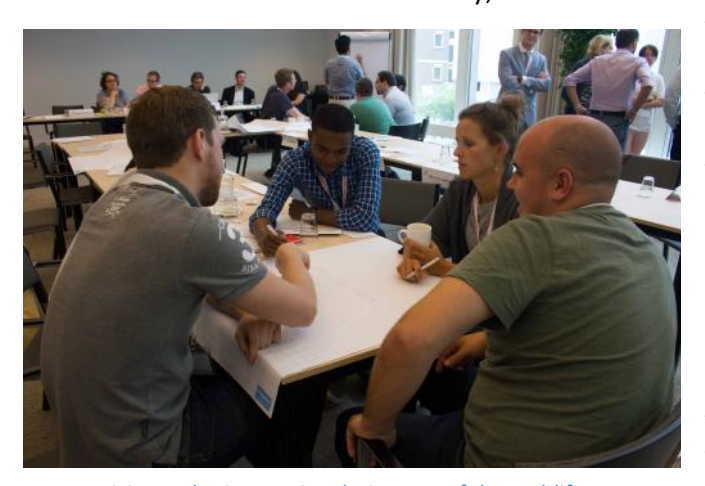
Participants brainstorming during one of the real-life case studies

After a well-deserved lunch break, we shifted the focus towards making your project a success. In the first session after lunch on Saturday, titled Internal Communication, we had participants work