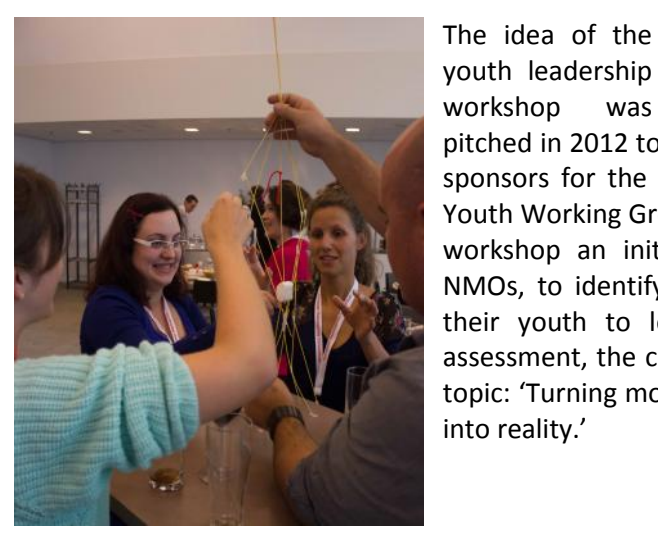
One of the groups in action while building their spaghetti tower