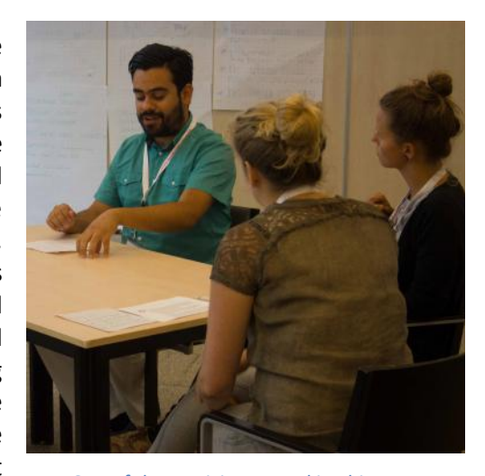
One of the participants making his case against the other actors in the role play

The last session of the workshop consisted of four role plays, done in groups of four. Each participant was given a role, without knowing what the other participants' roles were. The role plays, which were based on real-life scenarios, were designed to let participants see and feel how difficult it can be to get everybody on the same page in meetings, where often people have their own agenda. After a short preparation time, the first four participants confidently took their places at the table and startled every facilitator with their performance. Following a loud applause actors reflected on what had happened during their role play meeting and how the outcome could have been better. The result was a clear improvement on the following role plays, with participants taking into account previous comments, illustrating the high learning curve of the exercise.