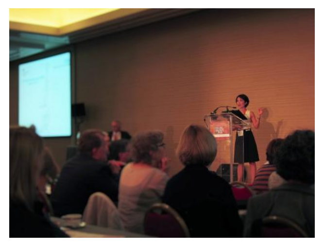
Presentation during the event

with men, a collective term to describe all males who engage in sexual activity with other males, regardless of how they identify themselves in terms of sexual orientation) eligibility to donate blood. There is a wide variation in how this controversial issue is approached, with indefinite deferrals for MSM in some countries and no deferrals in other. Discussion on which solution is better caused some commotion in the audience but no apparent consensus was reached.