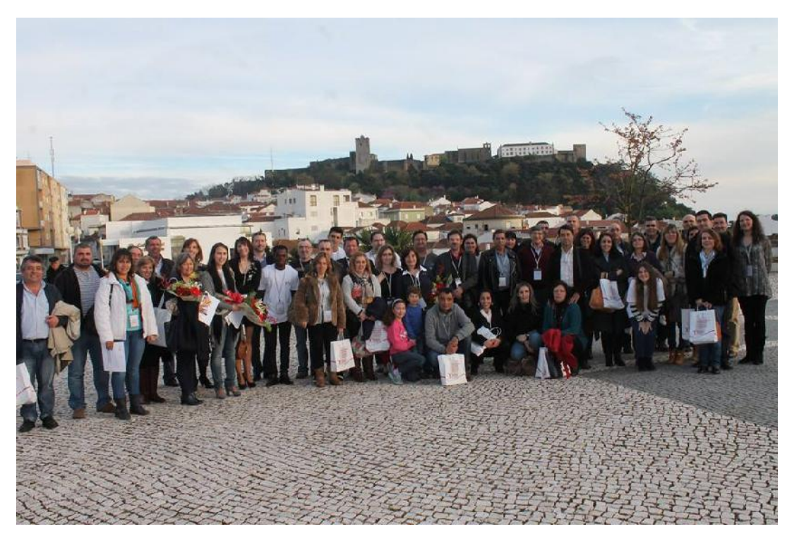
Participants at the first parents' conference of the Portuguese Haemophilia Society

However, after the initial shock, it is time to face the situation and to find out more about the disease, the right treatment and to join support groups that can help to demystify haemophilia and everything that comes with it.